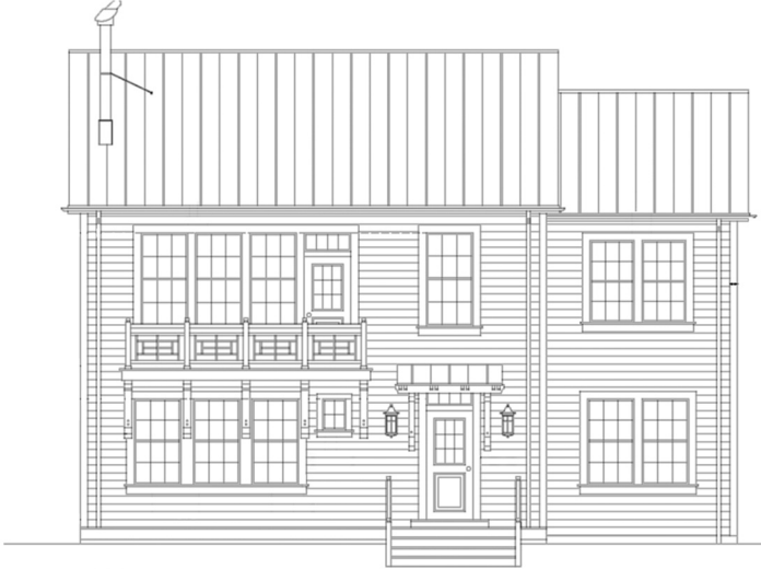
01 WEST ELEVATION A.3 1/4" = 1'-0" SCALE