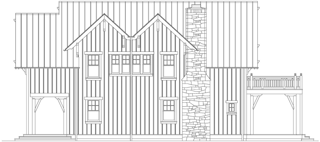
01 A.4 SIDE (EAST) ELEVATION 1/4" = 1'-0" SCALE